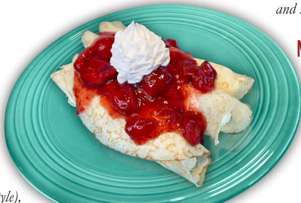
STRAWBERRY AND CREAM CHEESE STUFFED CREPES

Toasted banana bread, topped with fresh bananas and served with maple syrup. – Add sautéed bananas (foster style), caramel, chocolate, and powdered sugar for $1.45 Add pureed strawberries for $1.25